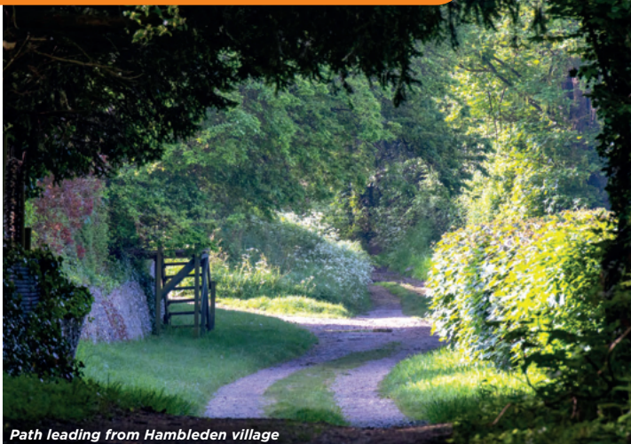
Path leading from Hambleden village