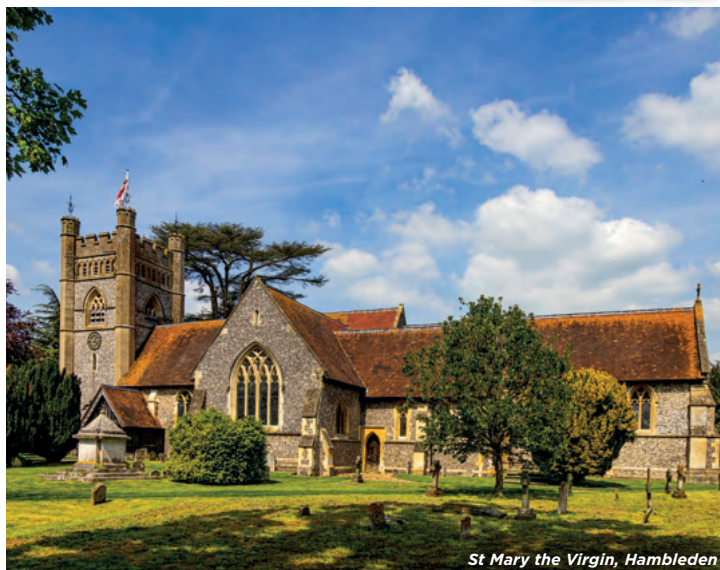
St Mary the Virgin, Hambleden