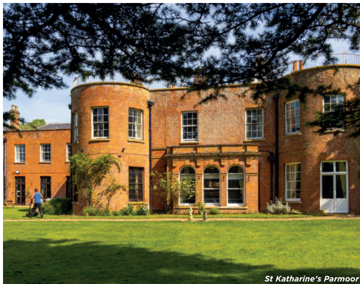
St Katharine's Parmoor