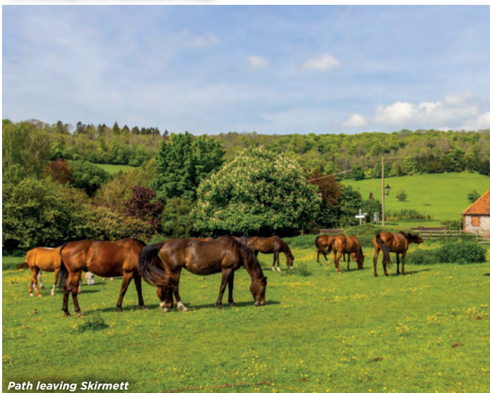
Path leaving Skirmett