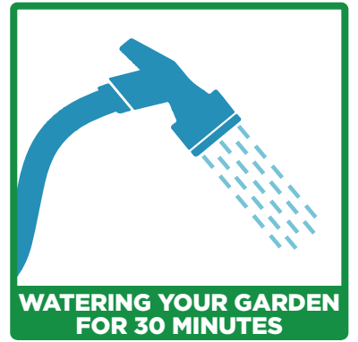
WATERING YOUR GARDEN FOR 30 MINUTES