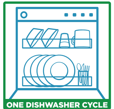
ONE DISHWASHER CYCLE