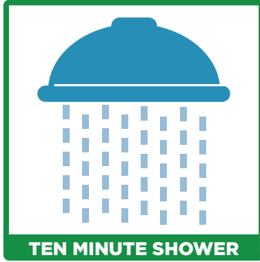
TEN MINUTE SHOWER