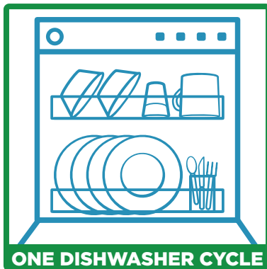
ONE DISHWASHER CYCLE