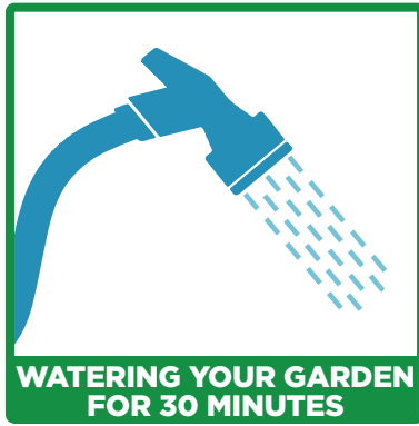
WATERING YOUR GARDEN FOR 30 MINUTES