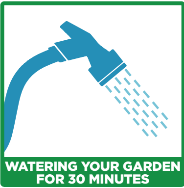
WATERING YOUR GARDEN FOR 30 MINUTES