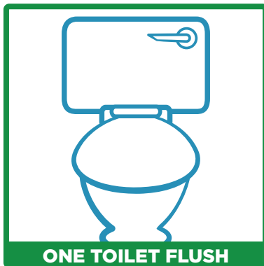
ONE TOILET FLUSH