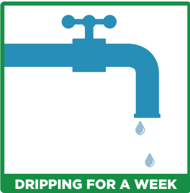
DRIPPING FOR A WEEK