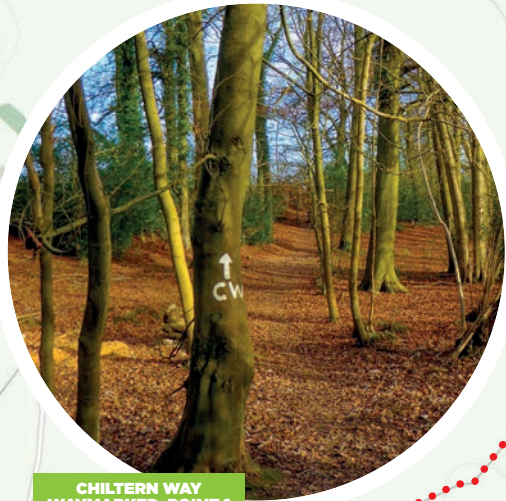
CHILTERN WAY WAYMARKED, POINT 1