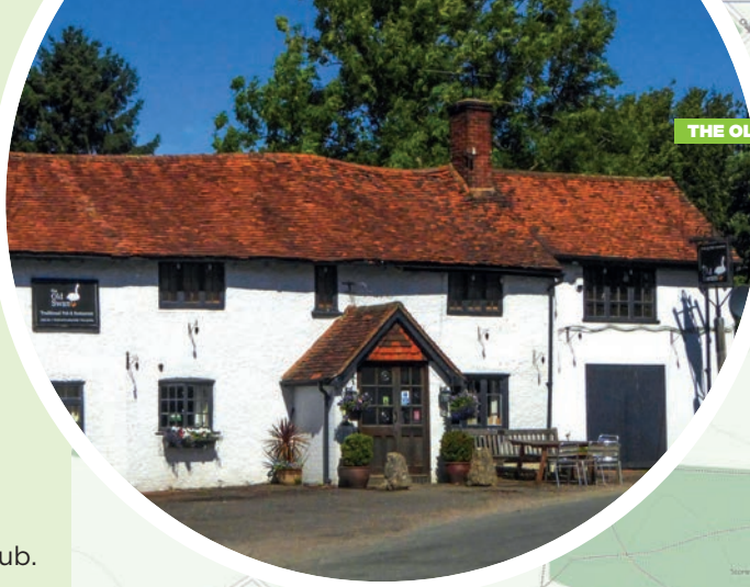
THE OLD SWAN