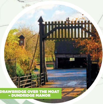
DRAWBRIDGE OVER THE MOAT - DUNDRIDGE MANOR