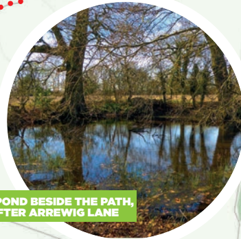
A SMALL POND BESIDE THE PATH, JUST AFTER ARREWIG LANE