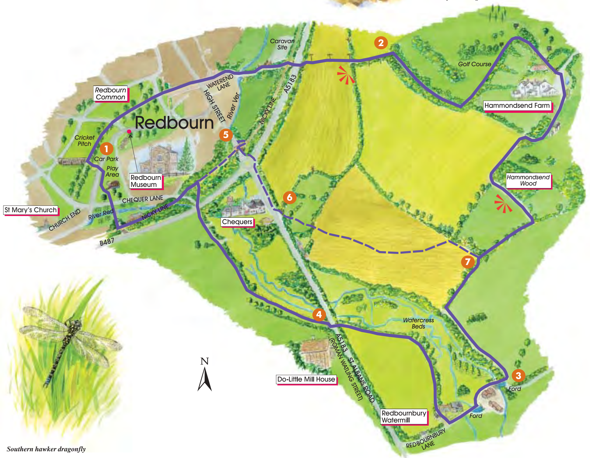
Southern hawker dragonfly