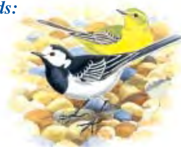
Pied and yellow wagtail

The Ver Valley Walk is a linear route between Redbourn and Bricket Wood. A leaflet is available from the CMS