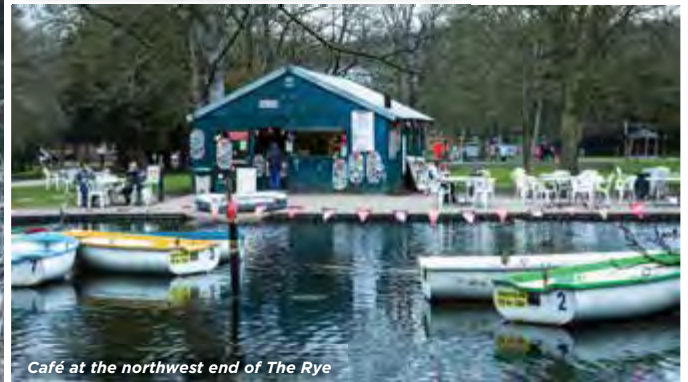
Café at the northwest end of The Rye