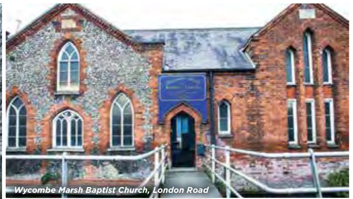
Wycombe Marsh Baptist Church, London Road