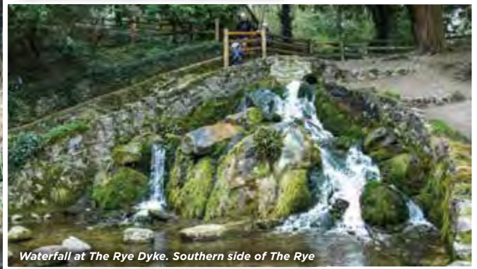
Waterfall at The Rye Dyke. Southern side of The Rye