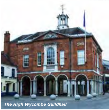
The High Wycombe Guildhall