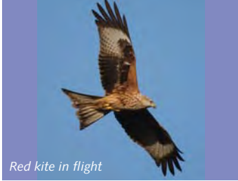
Red kite in flight