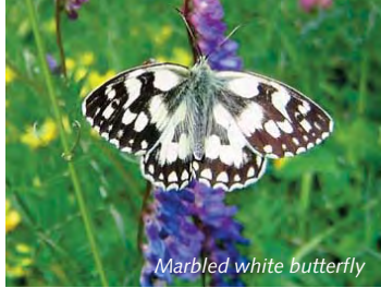
Marbled white butterfly

The Chesham Community Vision (tel. 01494 774842) has launched the following new walking routes in 2008: